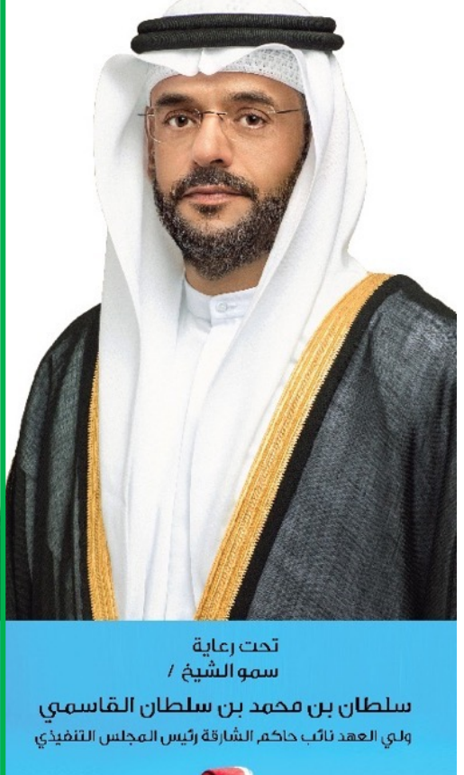
بطول<mark>ة الشارقة الدولية للطيران الشراعي</mark> Sharjah International Paragliding Championship