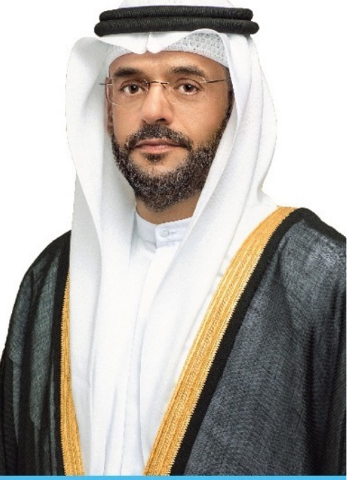
تحت رعاية سمو الشيخ / سلطان بن محمد بن سلطان القاسمي ولي العهد نائب حاكم الشارقة رئيس المجلس التنفيذي