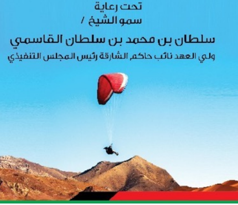
بطول<mark>ة الشارقة الدولية للطيران الشراعي</mark> Sharjah International Paragliding Championship