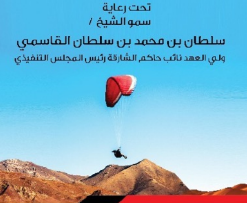
بطولة الشارقة الدولية للطيران الشراعي Sharjah International Paragliding Championship