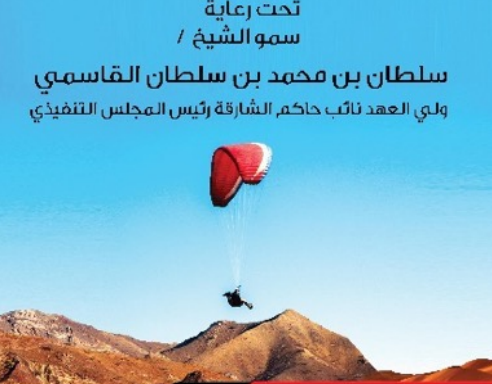
بطول<mark>ة الشارقة الدولية للطيران الشراعي</mark> Sharjah International Paragliding Championship