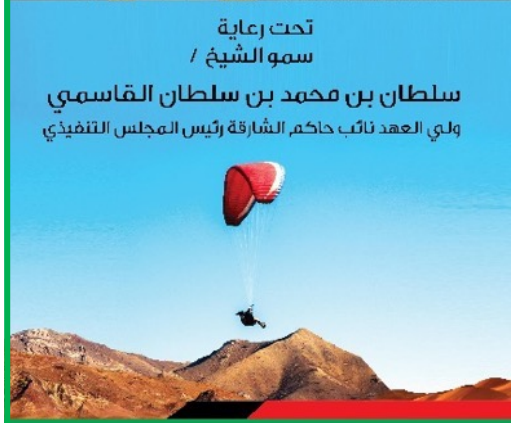
بطول<mark>ة الشارقة الدولية للطيران الشراعي</mark> Sharjah International Paragliding Championship