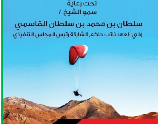
بطول<mark>ة الشارقة الدولية للطيران الشراعي</mark> Sharjah International Paragliding Championship