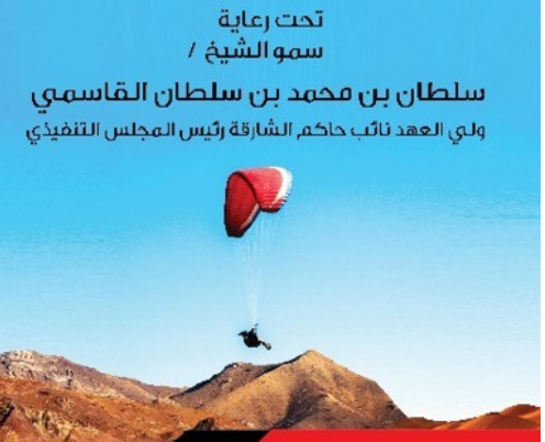
بطول<mark>ة الشارقة الدولية للطيران الشراعي</mark> Sharjah International Paragliding Championship