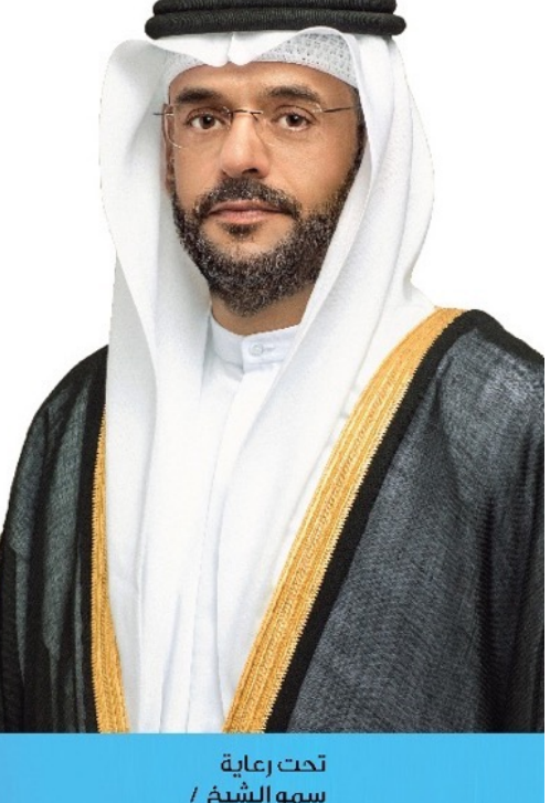
سمواًلشيخ / سلطان بن فحمد بن سلطان القاسمي ولي العهد نائب حاكم الشارقة رئيس المجلس التنفيذي