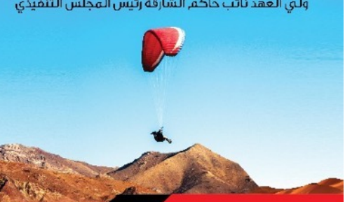
بطول<mark>ة ال</mark>شارقة الدول<mark>ية</mark> للطيران الشراعي

Sharjah International Paragliding Championship